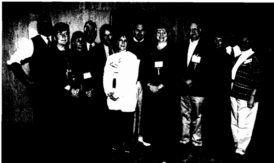
Incoming Officers and Board of Directors, Quebec, 2000

The Navy team conducted a total of twenty-nine dives, contending with the stormy seas, strong currents and poor visibility that make the Cape Hatteras area such a difficult area in which to conduct dive operations. Navy combat photographers recorded unprecedented video and still photographic images of the areas of the hull that are exhibiting dramatic signs of disintegration: the stern and engineering spaces, aft of the midships bulkhead. The expedition, sponsored by NOAA, the U.S. Navy, and The Mariners' Museum, began on June 17 with unfavorable surface conditions and strong bottom currents that prevented divers from working on the wreck of the Monitor . By June 20, conditions had