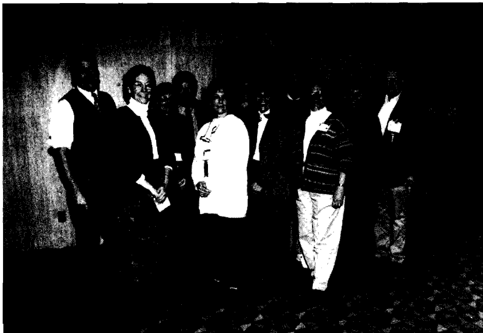
Outgoing Officers and Board of Directors, Quebec, 2000

• U.S. Naval Wrecks Survey: The Division recently received a Department of Defense Legacy grant to inventory US naval wrecks in South Carolina waters, with an empha-