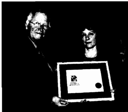
Award accepted by Jean-Paul L'Allier, Mayor

For helping to explore, preserve, and present to the public the archaeological heritage of the City of Quebec