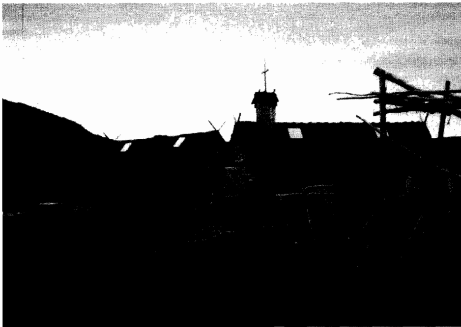
The living history museum of Norstead, a Norse trade centre, in L'Anse aux Meadows, Newfoundland.