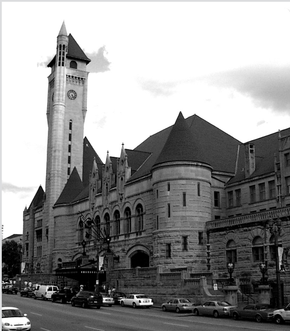
St. Louis' Union Station is the centerpiece of the Conference hotel and the SHA 2004 experience.

This promises to be a memorable conference, and we hope that you will be able to meet us in St. Louis next January. Please mark your calendars and plan to attend.