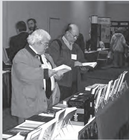
Browsing the book room