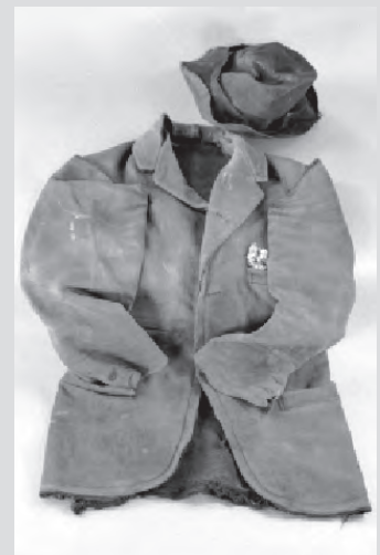
Working man's clothing from Railroad Exchange Hotel well

Several features dated to the 1870s, the early days of urban development in West Oakland;