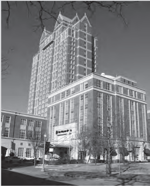
The conference hotel