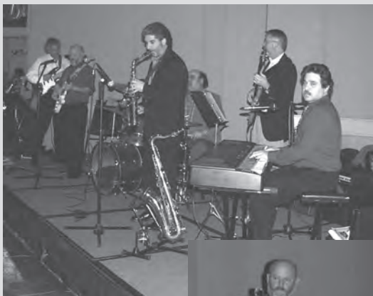
The band at work