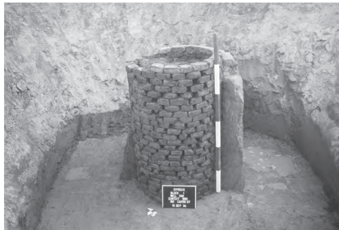
Excavation of a well on the Cypress Project

These disparate stories could pertain to one man, but it is by no means certain. We can be certain from the Tilghman-Holland privy deposits, however, that the household enjoyed a life of middle-class comfort. They