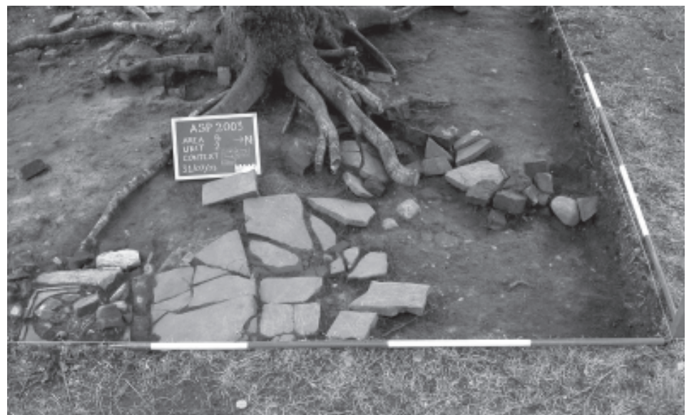
Figure 3: Detail, Area B, Alderley Sandhills Project, September 2003

Oral histories related to the southern cottage in Area B demonstrated similar patterns of continual architectural additions, recycling, and reuse (Figure 3). The immediate exterior space around the cottage was particularly adaptable for income-generating activities. When questioned about the location of the front door during a site tour, Mrs. Edna Younger instead related her mother's use of the area for laundry processing. Contributing to the family income by taking in laundry from local elite households, her mother had positioned her washtub and mangle next to the exterior drain, thereby adapting the paved courtyard as an extension of her workplace. Mrs. Younger could not remember the location of the front door because she had always used the kitchen entrance at the side of the cottage. Her memory illuminates another crucial point regarding working-class settlements: the fluidity between domestic spaces and work-re-