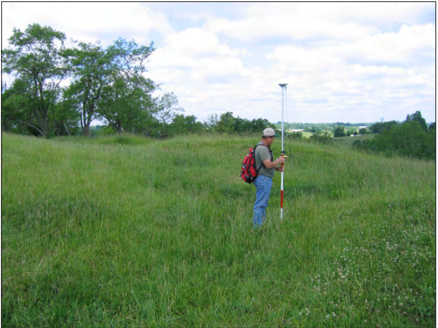
GPS mapping of Stanford Civil War fortification.

The fortification is on a prominent ridge toe providing substantial line-of-sight in three directions. The earthworks consist of a ditch and embankment placed around the perimeter of the ridge toe and probably once forming a closed oval; a small portion of the works was eradicated during construction of a house. The work is punctuated by as many as 21 gun emplacements many of which are prominent. To date, CRAI has completed a map of the earthwork feature. Limited metal detector survey, geophysical survey, and augur transects across the works has been proposed as a means to identify the intensity of occupation and locate other features associated with the fortification, in particular within its perimeter. Additional historical research will also be required to provide a context for this site and perhaps identify its date of construction and use and the makeup of its garrison.