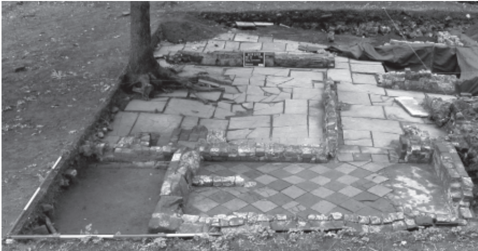
Figure 2: Area A, Alderley Sandhills Project, September 2003

Following geophysical and topographic surveys of the Sandhills site, four excavation trenches were opened during the summer 2003 field season. Areas A and B were originally two 10 x 10 m open area trenches, positioned over structural remains of Hagg Cottages. With the Hagg Cottages constructed and occupied as a reflection of socioeconomic continuity, the structures themselves reflected the durability of community presence within the landscape (Figure 2).