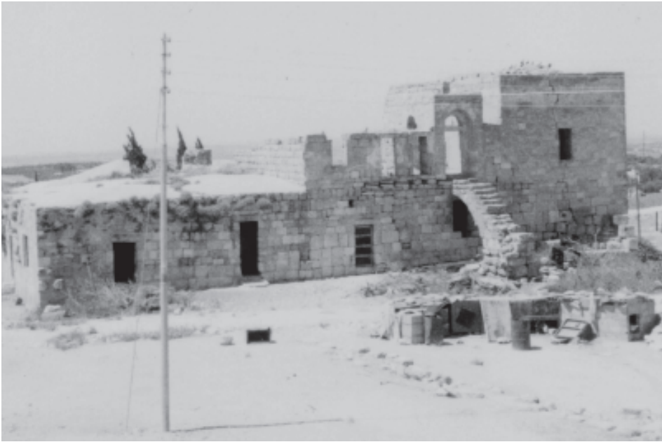
Farmhouse complex at Hesban.

sons indicate that local villagers in present-day Hesban believe that the caves were used as places to hide from Ottoman officials, tax collectors, and soldiers. The caves may have been used as a way to deposit, store, or even conceal goods.