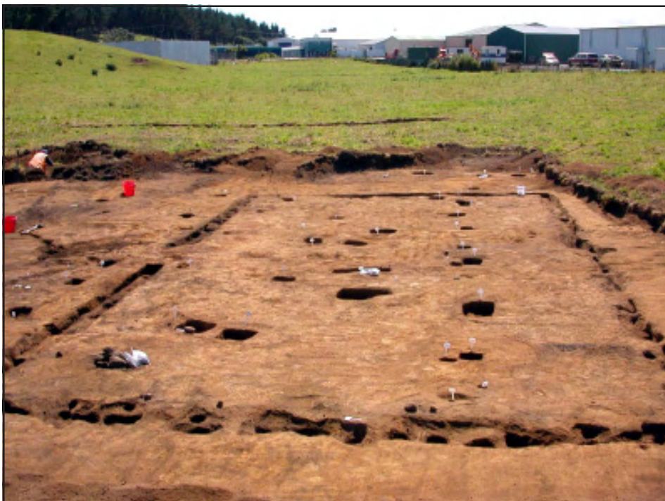
Maori house at Katere