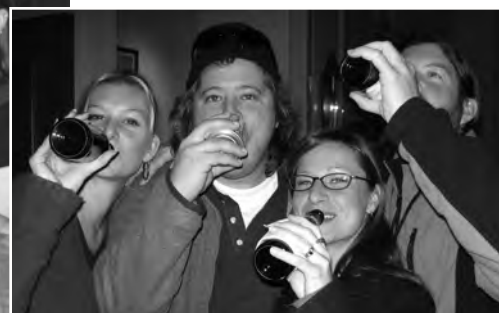
Clockwise (more or less) from upper left: at the William and Mary Anthro Department open house; happy banquet attendees; cutting the rug at the silent auction; some where, some night, usual suspects; some bar, some night, same faces; shopping at the silent auction.