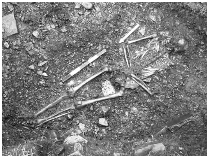
Full view of human remains, in Area C at Dos de Cheval, Crouse (EfAx-09).

Wet weather and the excavation of human remains cut into the time we had for survey work. We did manage to get to the Grey Islands. At Frenchman's Cove (EeAv-03), we identified a large early modern fishing station, consisting of large subrectan-