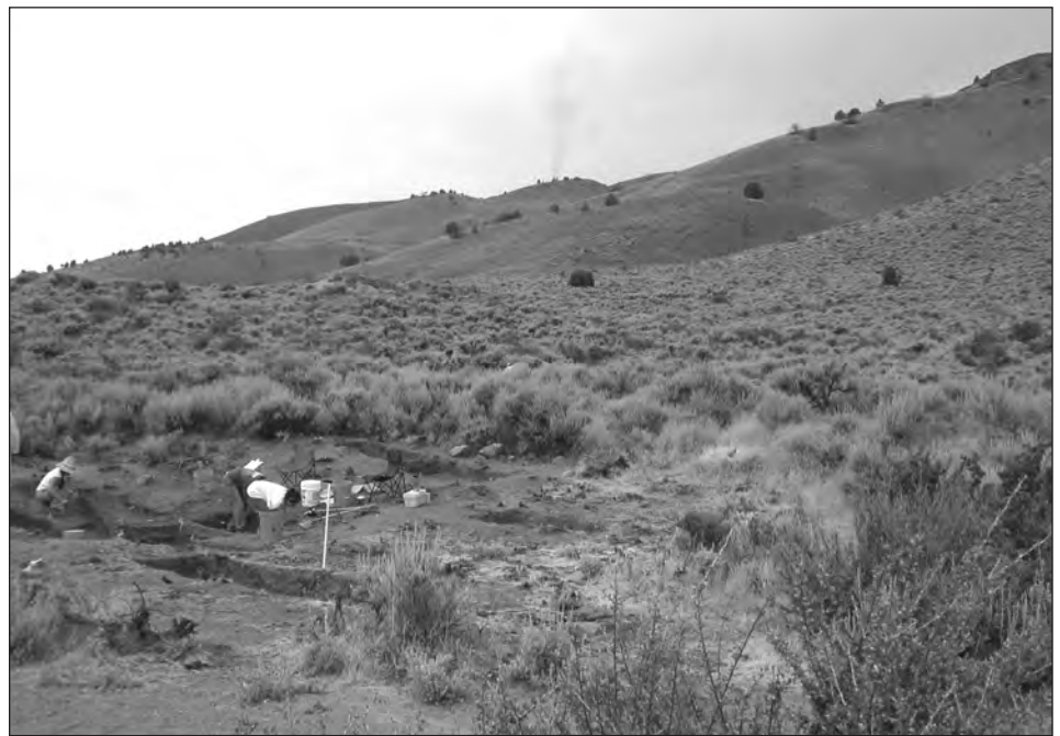
Site of Scales, with fire on the mountain in background.

the field season and is being conducted at the University of Nevada, Reno historical archaeology lab and will continue through early summer, 2007. Student volunteers and staff have made significant inroads into the sizable collection and some trends have already been identified. Although laboratory analysis is still ongoing, it is clear from the archaeological record that section camp laborers cannot be associated exclusively with consumption of low-status goods. Items of personal adornment, material culture associated with public display, and land-use patterns indicate that residents aspired to at least some degree to middle-class ideals. In the case of the section foreman, he and his family appear to have manipulated their compound in order to mimic an agrarian homestead. This appeal to the nobility of landscape renewal and improvement was in keeping with dominant American middle-class values. This landscape orientation also resulted in the implementation of middle-class gender roles for the foreman and his wife as reflected in the public/domestic dichotomy found in white Victorian