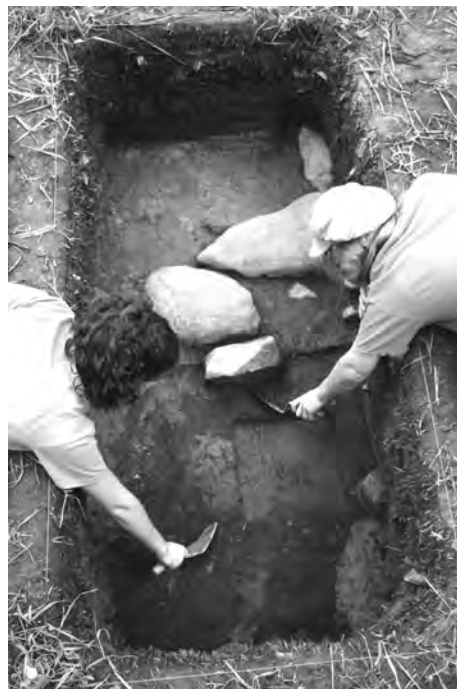
Excavation of a fireplace feature.