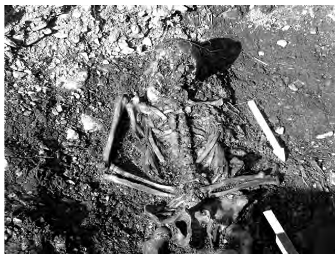
Upper torso of human remains, in Area C at Dos de Cheval, Crouse (EfAx-09). Note the circular hole in the frontal cranium and the associated non-human bones.