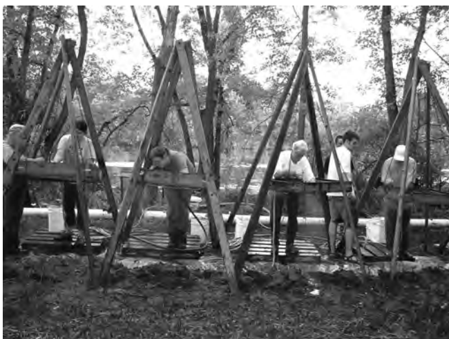
Wet screening operation.

been affixed to a crucifix and a cuff link inset with cut glass, evidence of religious beliefs and styles of dress respectively.