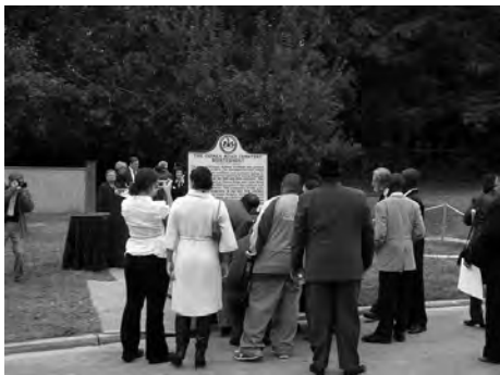
Gibson-Parker family members and general public viewing historic marker in Pleasant Valley Memorial Park.