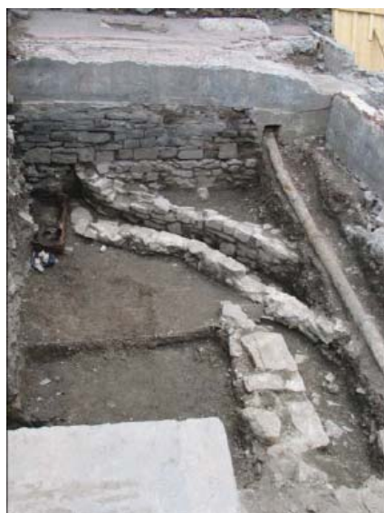
Remnants of a stone drain connected to North wall of the coachmen's house. This serpentine formation cut off a wall fragment see in the lower part of the picture, while a later iron drain pipe is seen on the right side of the picture.

Dwellings were built for coachmen to the east of Thompson's dwelling at the turn of the 19th century. The northern wall of