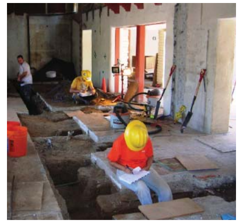
Recording excavations in the adobe yard area

marily with butchered bone. Analysis by Susan Arter of the bone from the pit feature and the rest of the site identified an overall reliance on beef butchered using saws for the most part. A small amount of cleavered bone was also recovered. Skeletal parts identified as butchering waste were found in limited amounts, suggesting that primary butchering occurred off-site. Steve Van Wormer's analysis of the artifacts identified the majority of the vessel glass, ceramics, and other datable artifacts recovered from the site as being within the time span of the adobe, specifically the years during which it housed the saloon. The project provided information relevant to an important era in San Diego history, and to the OTSD-SHP's interpretive period. For additional information contact: <Jamie.Cleland@edaw.com> or <Tanya.Wahoff@edaw.com>.