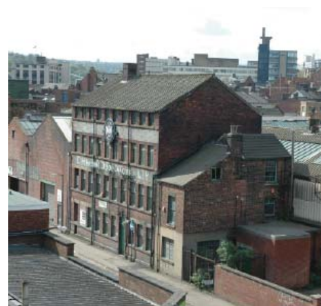
The Snow Works, Sheffield

and the railway infrastructure introduced in the 1840–1850s.