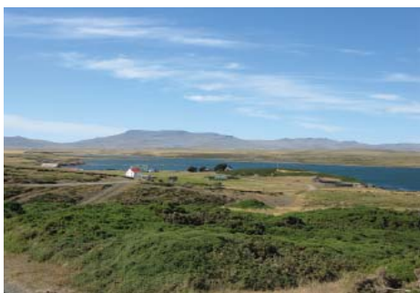
General view of Darwin settlement and Darwin Harbor

tinuing program of archaeological work on the early settlements of the Falkland Islands. The survey of a related group of sites also owned by the Falkland Islands Company has recently been published in a monograph (Philpott 2007).