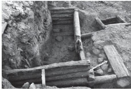
A probable 18th-century smithy and a timber-lined well excavated in Tornio in 1999.

Urban Research Project: Oulu and Tornio: The Finnish towns of Oulu and Tornio lie 170km and 70km, respectively, south of the