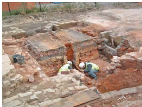
Fieldwork at the Sheffield Inner Relief Ring Road

Prior to the archaeological excavations, standing buildings along the route of the new road were surveyed and photographed before being demolished. This work has revealed that many of the buildings dated to after the construction of Corporation Street, an earlier road scheme linking Bridgehouses to the center of Sheffield. The buildings reflected the dense urban fabric of the late 19th century, comprising a tight mix of houses, pubs, warehouses, grinding hulls, cutlery works, foundries,