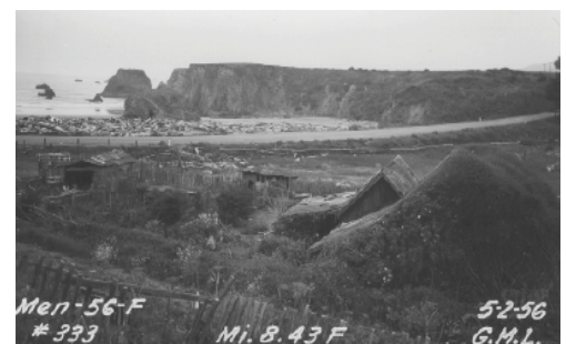
The Seaside farm on June 2, 1956 shortly before abandonment (photograph courtesy of Caltrans).

The History of Native American Adjustments at Seaside: Recent archaeological and historical investigations at Seaside, north of Fort Bragg in Mendocino County,