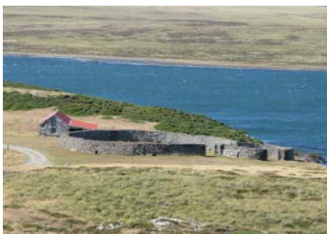
Late 19th-century stone-built structures at Darwin

The project was funded by a grant from the Shackleton Scholarship Fund and the