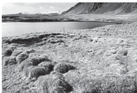
The enclosure earthworks at Kaupstaðartangi.

The site of Kaupstaðartangi both overlooks the bay and also has a clear view westwards down the fjord. There is one building with walls of turf faced with stone. The earthworks of a square enclosure can be seen a short distance to the northeast. The enclosure was probably used to store stockfish for exchange and is located just above a very small cove which could have been used for drawing up boats. To the northwest of the enclosure are two further adjoining buildings with stone and turf walls that have been identified as boat shelters. The remains of the site have been surveyed in detail and it is hoped that they will be excavated in 2008.