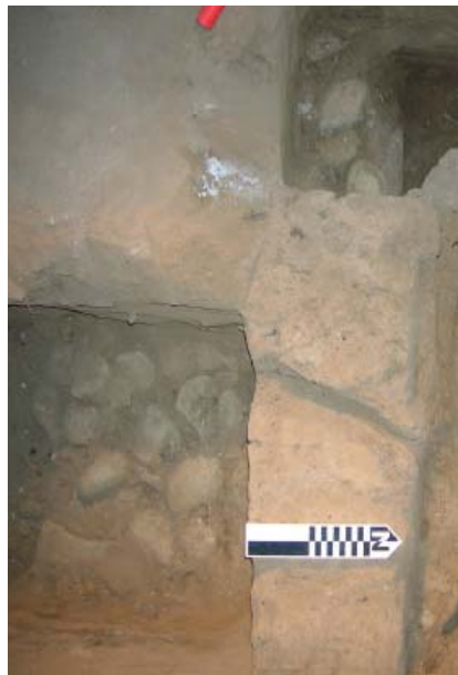
Portion of exterior adobe wall and cobble foundation

There is little documentary evidence available regarding the configuration and precise location of the adobe. EDAW's staff was successful in locating the cobble foundations for two exterior and two interior walls of the adobe, and a trash pit filled pri-