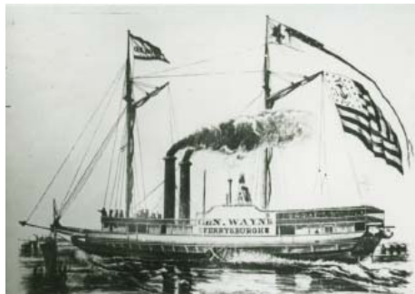
The steamboat Anthony Wayne

CLUE continues to research, discover, and document the underwater cultural heritage of Lake Erie and the other Great