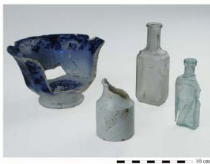
Artifacts recovered from the sheet midden.

West of Thompson's houses were overlying architectural features attributed to a building owned by Barthélémy Pépin dit Lachance built ca. 1874 and destroyed in 1955. One extremely rich layer, interpreted as a sheet midden, contained 27 different types of ceramics and 550 animal bones.