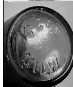
Figure 14 – C Co 2 on packer base (Maas 2014)