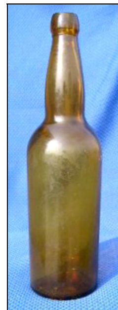
Figure 7 – CV export beer bottle

This mark is found on the base of a grooved-ring wax-sealer fruit jar with CCO2 in an arch at the top of the base, and MILW in an inverted arch at