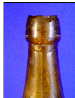
Figure 11 – Detail of finish