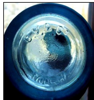
Figure 2 – C.V.G.CO. (Maas 2014)

The C.V.G.CO. logo was reported by Ayres et al. (1980:unnumbered page), Reilly (2009 [1997]), Maas (2014), and we found an example in the Fort Laramie collection (Figures 2 & 3). The mark may have belonged to the earliest company and was used prior to the opening of plant No. 2 (although Reilly attributed the logo to the No. 2 factory). The plus sign is also unique in the Chase Valley series and was probably a mold maker’s “signature.” An eBay auction also included a photo of the mark without the plus sign. The mark was probably only used in 1880 – although the mold was likely used until it wore out.