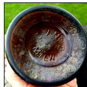
Figure 9 – C.V.N°2 basemark (Maas 2014)