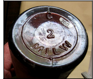
Figure 1 – C / MILW (Fort Laramie collection)

Toulouse (1971:111) identified this as the first mark used by Chase in 1880. The "C" was at the top of the base, with "MILW" in an inverted arch at the bottom. Herskovitz (1978:8) found seven of the C / MILW marks on beer bottle bases at Fort Bowie (1882-1894). They were accompanied by numbers 1-3. The C / MILW mark from the Tucson Urban Renewal Project was also shown in Ayres et al.