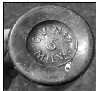
Figure 4 – C.V.N° 1

Export beer bottles embossed on their bases with “C.V.N° 1 / MILW” have been reported in small numbers by Ayres et al. (1980), Jones (1966:7; 1968:15), Lockhart and Olszewski (1994), and Wilson (1981:115). Although Wilson drew his example on a large post bottom, all others were reported in a small post (Figure 4). In each example, the “o” in “No” was in superscript but was not underlined. Mold numbers in our sample ranged between 5 and 9 (with a dot in front of the “9” like a decimal point).