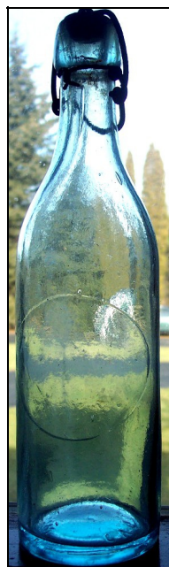
Figure 10 – CV champagne beer bottle (Maas 2014)