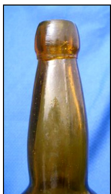
Figure 8 – Detail of finish

legitimate variation. Other bases from the Tucson Urban Renewal Project, eBay, Fort Stanton, and Fort Laramie extend the total numbers from 1 to 8 (Figures 6-8). All variations of the mark should be dated 1880-1881. The Maas photo shows detail of the “C°” – which usually had two dots below it, although one example appears to have an underline and another appears to have no underline or dots.