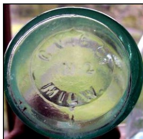
Figure 15 – CVGCo / No 2 (Maas 2014)

Both Reilly (2004 [1997]) and Maas (2014) reported this mark, and Maas included a photo of an example (Figure 15). This logo may have been one of the C.V.G.Co. molds used by the original firm prior to splitting into the two companies (see above). The “No. 2” may have been embossed in the center after the switch.