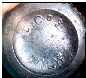
Figure 12 – C Co 2 on jar base (Maas 2014)

the bottom of the base (Maas 2014 – Figure 12). Creswick (1987:27) dated the mark 1880-1882 – although 1881 is the correct end date (Figure 13). Maas (2014) also recorded this variation of the logo on packer bottles (Figure 14). Note the very unusual rendition of the “2” on both the wax-sealer and packer bases.