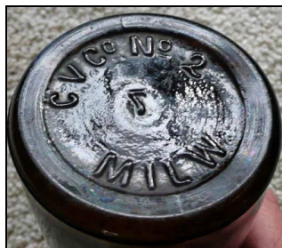
Figure 6 – C.V.C°N°2 basemark (Maas 2014)

legitimate variation. Other bases from the Tucson Urban Renewal Project, eBay, Fort Stanton, and Fort Laramie extend the total numbers from 1 to 8 (Figures 6-8). All variations of the mark should be dated 1880-1881. The Maas photo shows detail of the “C°” – which usually had two dots below it, although one example appears to have an underline and another appears to have no underline or dots.