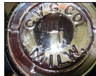
Figure 3 – C.V.G.CO. / + / MILW (Fort Laramie collection)

Kroll (1972:39, 58, 66, 109) listed four Wisconsin beer bottles marked C.V.G.Co. Although all four breweries were in business for long periods, each could have used bottles made in 1880. Kroll noted one of these bottles as “rare” and the other three as “very rare.” The rarity designations support the idea that bottles marked C.V.G.Co. were only made in 1880. Bottles made only during a single year could be expected to be found more rarely than those made for a longer time span.