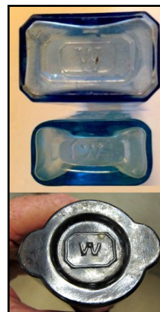
Figure 9 – Wood’s W logo

Since the letter “W” has been used by a great many bottlemakers over the years, early Wood’s Bottle Works bottles cannot be identified with any certainty before the enclosure of the letter in a rectangle, an event which probably took place about 1900 when other glass companies were beginning to adopt more sure identification means.