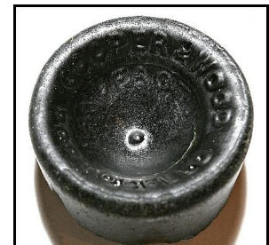
Figure 1 – Cooper & Wood base (Tim Ledford)

Toulouse (1971:142) noted that “a few ‘Cooper & Wood’ bottles, with and without the added designation ‘Portobello,’ have been found in western mining camps.” He dated the mark as being in use from 1859 to 1868 – the duration of the partnership. The only examples we have seen were English “beer” or “wine” bottles made of “black” glass (Figure 1). Green glass bottles – assuming any were made during this period – were apparently unmarked. These, of course, could have held either substance – or liquor.