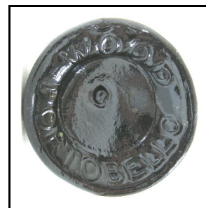
Figure 8 – Wood basemark (eBay)

Although none of the sources reported a mark during this period, an eBay auction offered a dark green bottle, made in a three-part mold – a dip mold with two upper mold pieces (Figure 7). The base was embossed “WOOD (arch) / PORTOBELLO (inverted arch)” in a Rickett’s mold (Figure 8).