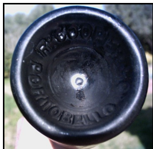
Figure 3 – R D Cooper base (Antique Bottles.net)

Toulouse (1971:141-142) illustrated this mark as “R D COOPER (arch) / PORTOBELLO (inverted arch)” around the outside of the base – one of three logos used by the Cooper factory. Although Toulouse did not supply this information, we suspect that the mark appeared in a Rickett’s-style plate – as found on the only photos we have seen