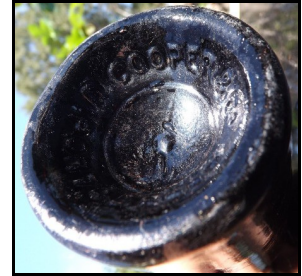
Figure 4 – R Cooper & Co. base (eBay)