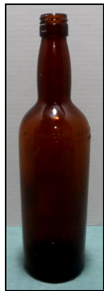
Figure 11 – Liquor bottle

1955 (Figures 11 & 12). The “WX” was almost certainly a logo – as required by the same 1934 regulation. Possibly, the mark continued in use on exported liquor bottles until the federal warning law was rescinded in 1964. Since the “WX” logo was already registered in the U.S. system, it may have been easier to continue the logo than to reapply.