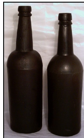
Figure 2 – Cooper bottles (Antique Bottles.net)

(Figures 2 & 3). Toulouse noted that bottles with all three logos had been found at “western mining ghost towns.” He noted that this was probably the oldest of the three marks. Although Toulouse very conservatively dated all three logos as “1868 to 1928 or later,” a logo of this style was probably not used later than the late 1880s. Thus, 1866-ca. 1885 is probably a reasonable range.