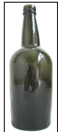
Figure 7 – Wood bottle

On December 4, 1898, the journal, Capital and Labour (1878:727), reported on a strike that began the previous Saturday (November 30) when the factory demanded that the journeymen (i.e., union blowers) increase their production the equivalent of four hours per week – for the same pay. The blowers almost immediately went on strike. The firm claimed that low European glass house prices had forced the demand. We have not discovered the outcome, but the strike was certainly resolved. The firm remained in business under the name of Wood’s Bottle Works until 1920.