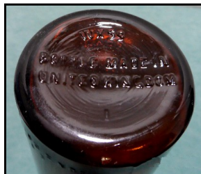
Figure 12 – WX logo

According to Toulouse (1971:525), the “WX” logo was used by the Wood’s Bottle Works, Ltd., from 1920 to 1937. Two eBay auctions offered bottles embossed respectively “WX 53” and “WX 55” on their bases. Although both were made in England, each was embossed with the U.S. federal warning label required between 1934 and 1964. The law also required two-digit date codes, so the “53” and “55” almost certainly indicated 1953 and